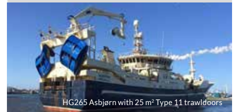
HG265 Asbjørn with 25 m 2 Type 11 trawldoors

Before the delivery about 30 of Thyborøn Trawldoor's staff stood in front of the doors and were not able to cover it's surface.