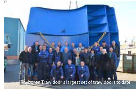
Thyborøn Trawldoor's largest set of trawldoors to date

A set of 8.5m 2 Type 20 VF "Flipper" is in use on the trawler HG 306 Tobis in Denmark. The trawler is twin rigging for shrimp in the North Sea with closed foils. When the trawler is twin rigging for cod and saithe all the foils are open to reduce the spreading power.