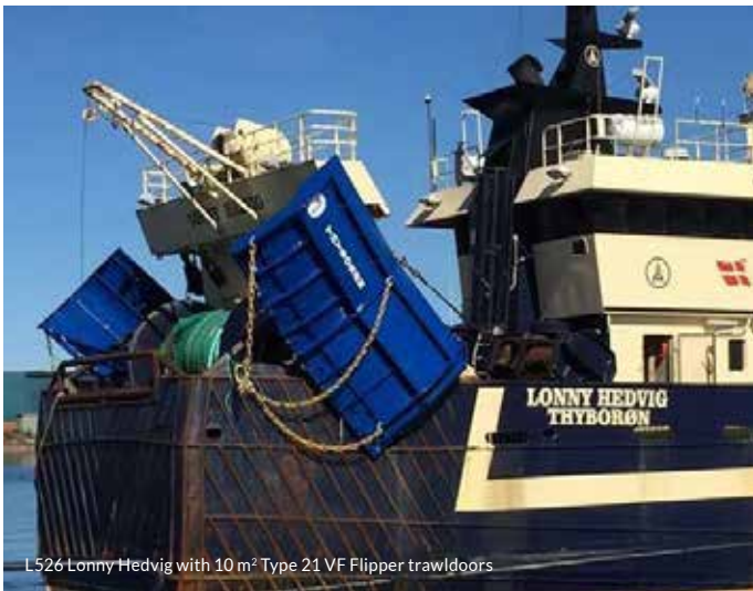
L526 Lonny Hedvig with 10 m 2 Type 21 VF Flipper trawldoors

J. Bergvoll T-1-H is single- and twin trawling for saithe, cod and haddock. They use 9m 2 Type 14 VF (4.200 kg) and for shrimp fishing they use 13m 2 Type 14 VF (5.800kg).