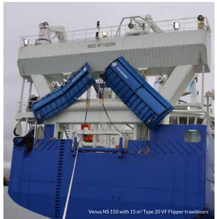
Venus NS 150 with 15 m 2 Type 20 VF Flipper trawldoors

"Gulli" reports, he started to use the new Thyboron 15m 2 Type 20 VF "Flipper" doors in spring. They fished for blue whiting close to the Faroe Islands with all of the adjustable foils closed. Gudlaugur Jónsson was extremely pleased with the results, the wide spread and good stability of the trawldoors in turnings.